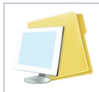
Electronic Medical Record