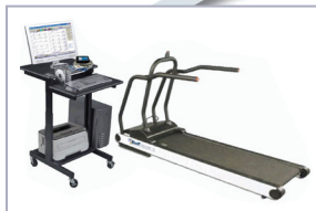
CardioStress™ Testing ECG

"Save time — Save lives" Improve workflow