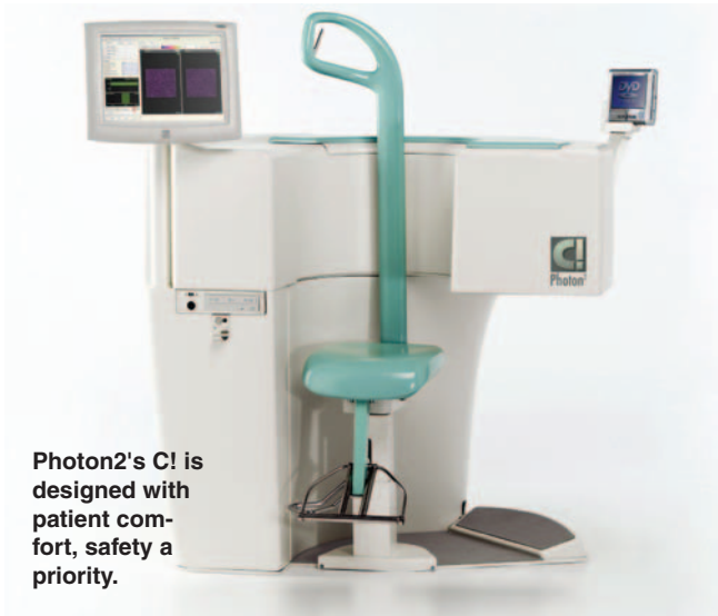
Photon2's C! is designed with patient comfort, safety a priority.

He believes that a hospital can save an average of $10,000 when buying refurbished stress test equipment and works with clients like Beth Israel Deaconess Hospital in Boston, MA. "If the equipment you need is not on our inventory list, we will do our best to locate it with no obligation to purchase," Gaw says. PRN is always looking to purchase equipment as well and says it will travel just about anywhere to get it. Because the company is a member of a nationwide buyers network, it's able to offer discounts on stress test and other equipment from many of the major medical equipment man-