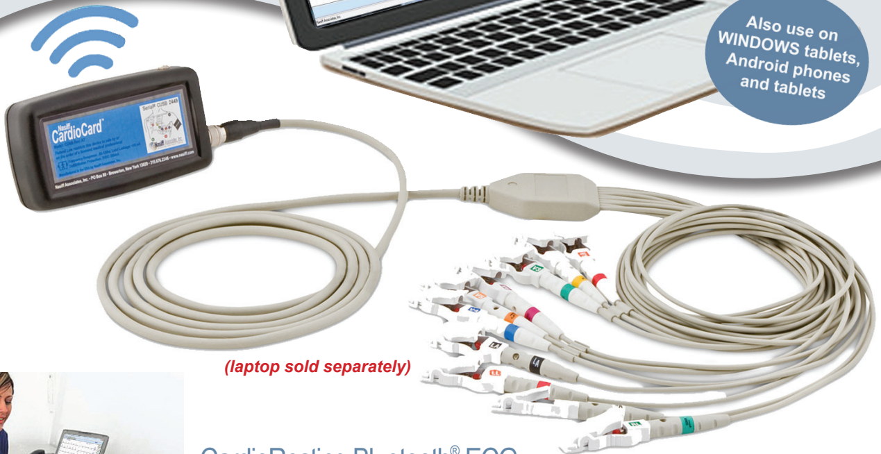
(laptop sold separately)

Also use on WINDOWS tablets, Android phones and tablets